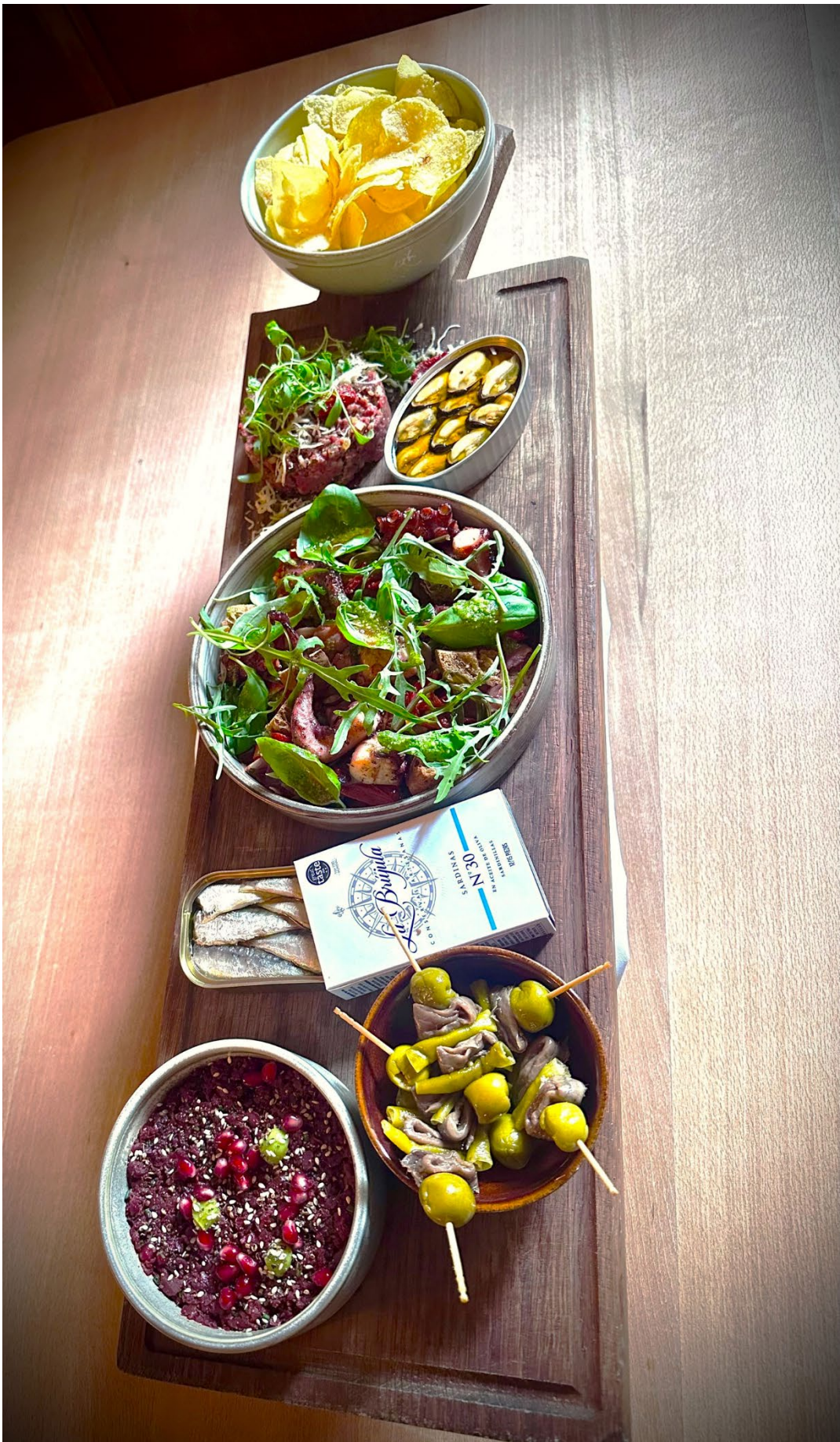
SCHLÖSSL SHARING BRETTL